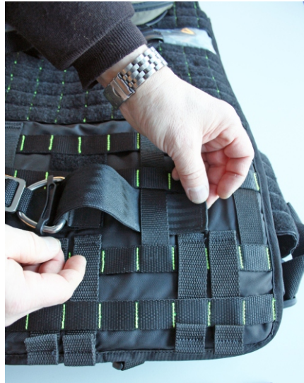
Place the belt through the first belt loop on the right side