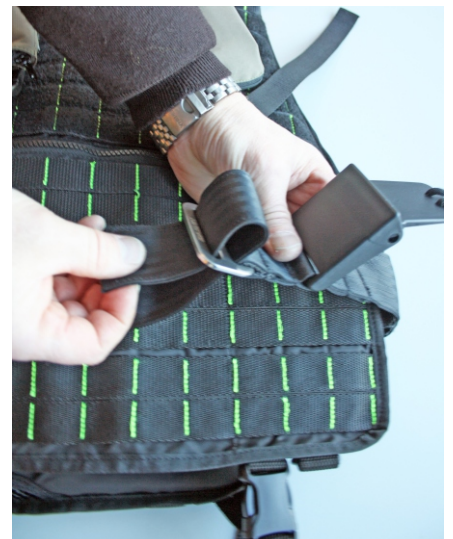
... and down again through the other opening in the metal buckle