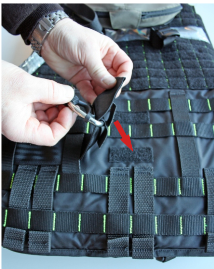
Put the belt through the D-ring on the cow-tail and attach it to the velcro patch