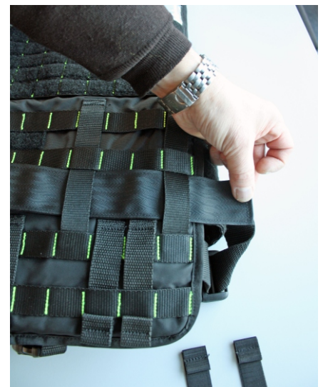
... and the second belt loop on the right side. Turn the lifejacket front side facing up.