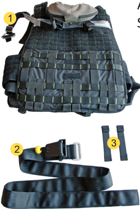
1: Cow-tail 2: Quick release-belt 3: Loose belt loops