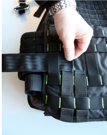
Place the lifejacket with the back side facing up. Put the belt through the first belt loop.