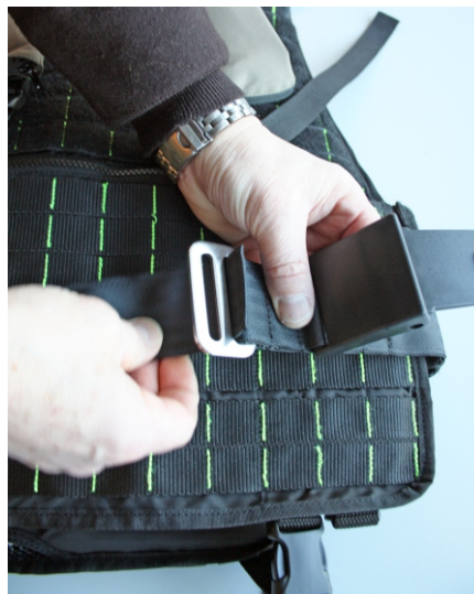
Put the belt through the right opening in the metal buckle.