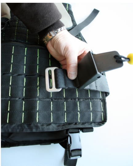
Pull out the other end of the belt from the backside of the lifejacket